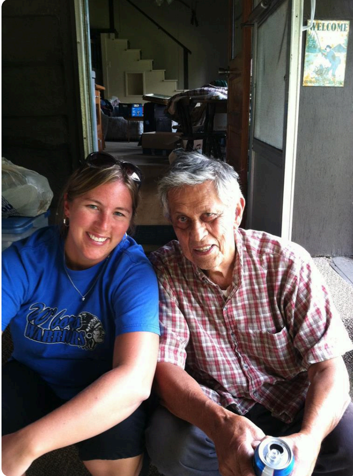
Grandpa & KelseyCamp 2013